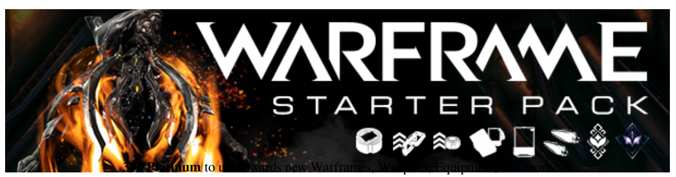
3-Day Resource and Affinity Boosters to speed up gathering resources for crafting new Equipment and leveling up your Arsenal

1 Hawk Mod Pack containing 5 random mods to instantly upgrade your Arsenal 1 Streamline Mod to increase your Ability Efficiency and allow you to use your abilities more often 1 Orokin Catalyst to supercharge your Weapons and double your mod capacity allowing for more upgrades 1 Orokin Reactor to supercharge your Warframes and Companions so you can double your mod capacity allowing for more upgrades